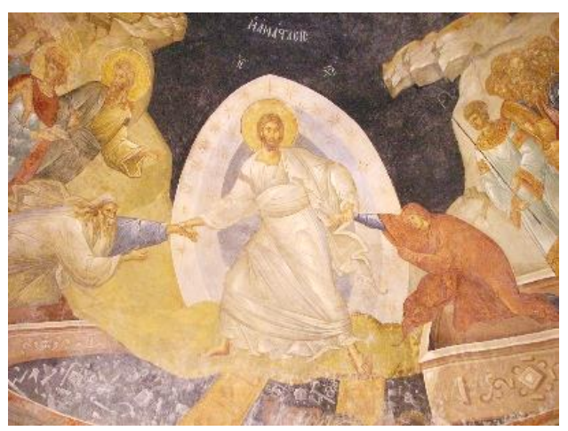
Fig. 1. Anastasis 1321 Karyie Djami, Istanbul

Theologically the concept derives from passages in the New Testament, notably Ephesians 4:9, 'Now that He ascended, what is it, but because He also descended first into the lower parts of the earth?'; and 1 Peter 3:19–20: 'God hath raised up Christ, having loosed the sorrows of hell, as it was impossible that He should be holden by it'. A very early source from the non-canonical tradition is the first century Odes of Solomon : 'Sheol saw me and was shattered, and Death ejected me and many with me' (42:11). However, icon painting throughout the Early Christian period avoided the Resurrection and the imagery for the subject only developed in the 8th century from the apocryphal Book of Nicodemus . The iconographic narrative depicted here originates from the art of Constantinople in the 14th century, namely the great Anastasis in the Chora Church. (fig. 1.)